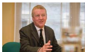
Ian Pringle QC